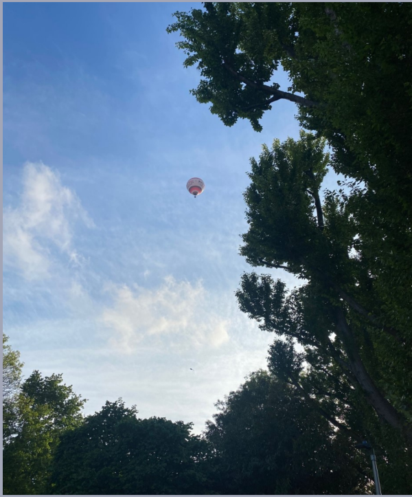
Picture: First air balloon over school spotted this year.