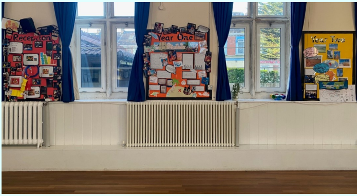
Picture: Hall display of Year group work in Term 4.