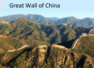
Great Wall of China