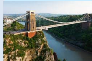
Clifton Suspension Bridge