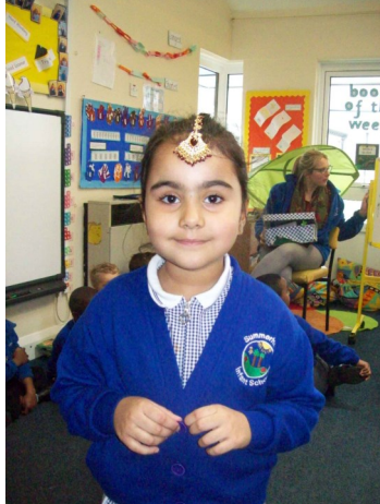
Celebrating children's family culture and traditions